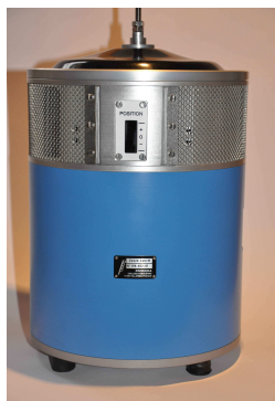
EX 220 C40 (250 N)

The long stroke modal shakers are powered by high output impedance current controlled amplifiers.