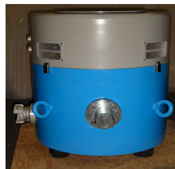
EX 5080 C50 (5000 N)