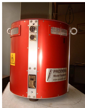
EX 1070 C50 (1000 N)